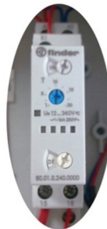
Multi range timer

The Williamson Manufacturing Company Ltd provides no warranty on usage of pumps. We recommend that life tests be carried out prior to use. This information is given in good faith and believed to be correct and current at time of publishing. The Williamson Manufacturing Company Ltd cannot accept responsibility for its inaccuracy or any errors or omissions contained herein. Copyright The Williamson Manufacturing Company Ltd 2008